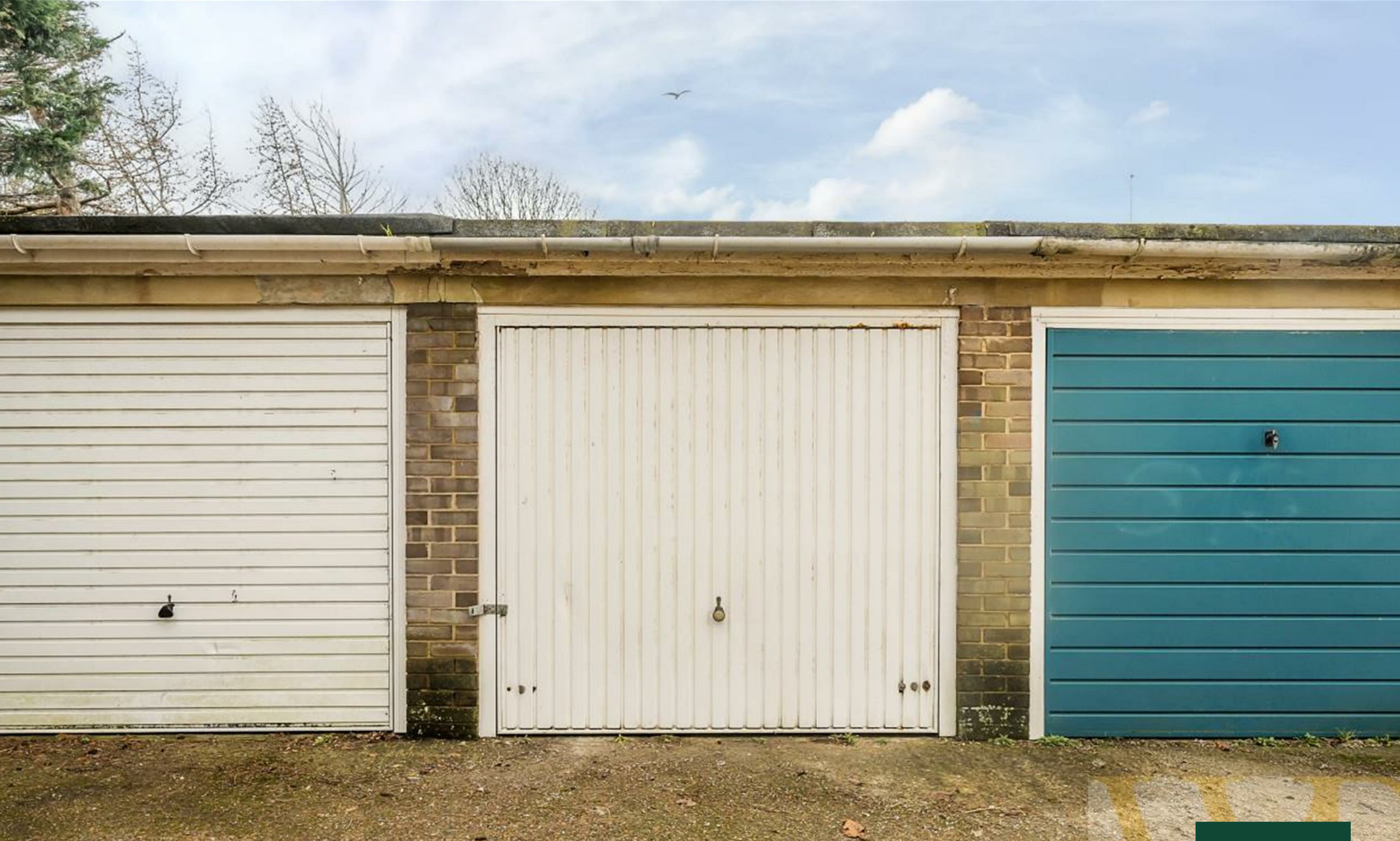
Garage No:2, Montague Court Rectory Road | | Shoreham-By-Sea BN40 6FL